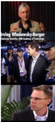
BlueCat execs describe their approach to managing IP addresses.